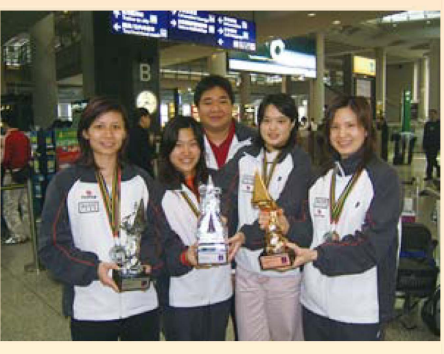
A good dietary habit not only ensures health but also brings your potential that pave the road of victory

The above information is provided by the Sport Nutrition Unit of the Athlete and Scientific Services Division. All information is for reference